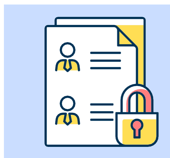
Your patient health records are sensitive.