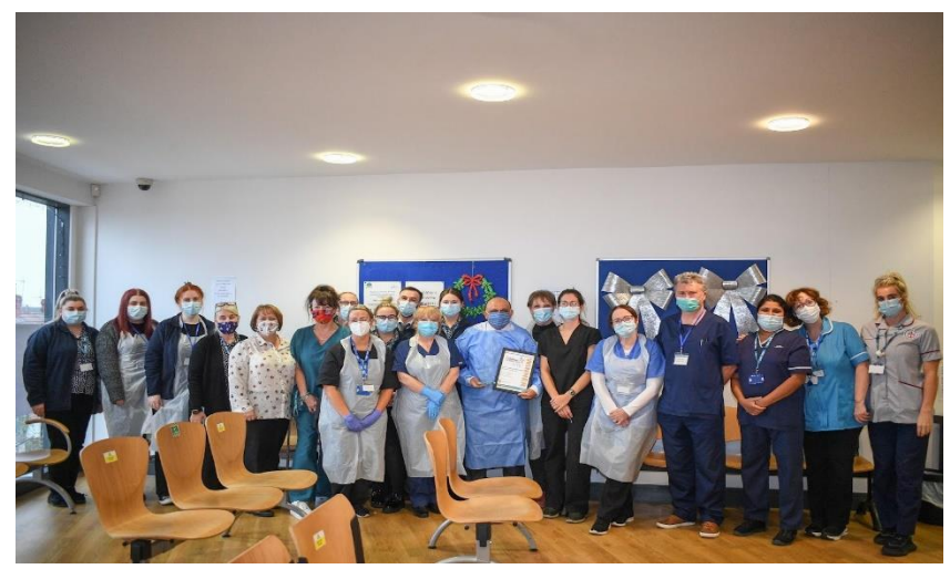
Vaccination Team with Wirral Globe Award